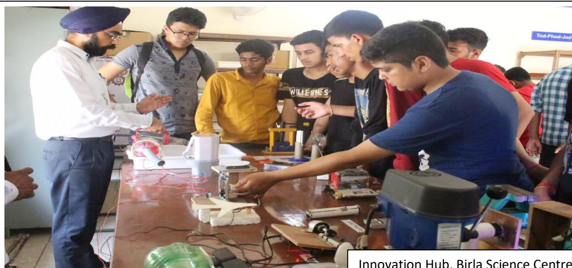
Innovation Hub, Birla Science Centre