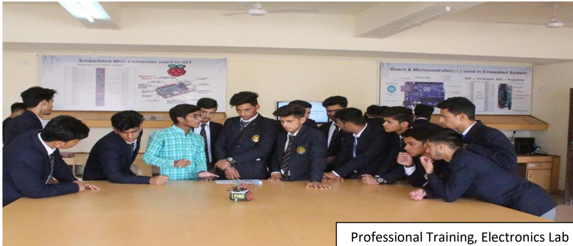
Professional Training, Electronics Lab