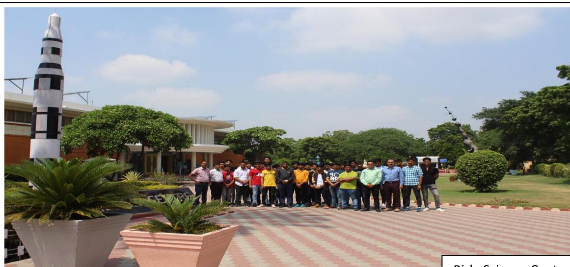
Birla Science Centre