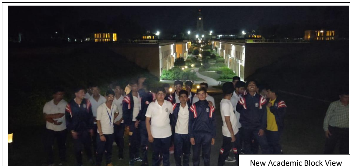
New Academic Block View