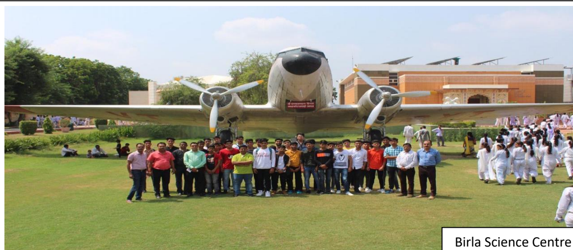
Birla Science Centre