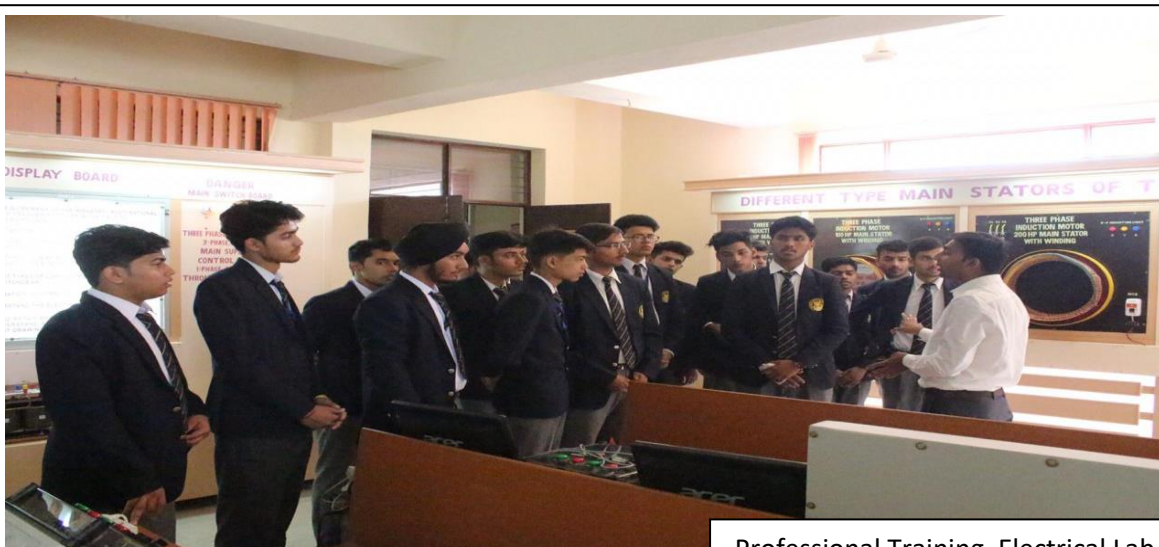
Professional Training, Electrical Lab